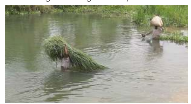
In Pic: Farmers Struggled to cross the river & various stages of bridge development

The construction of the new Tugelpurkamera river Bridge has revived social connections, boosted economic activity and improved access to education and health facilities between the villages of roorkee (uttarakhand). Gone are the days when villagers struggled to cross the big drainage full of water just to transport their crops, or visit a nearby village. With these facilities of road and bridge, the villagers would not only be able to have a contact with the rest of the villagers but they would use modern machinery of farming to increase their income with higher yield. A river drainage separates tughalpur village in two, now connected by the concrete bridge. Several times villagers built mud bridge, which were destroyed yearly by floods. As a result, there was no access between the two sides of the village. Everyday, these villagers used to swim a precarious river drainage risking their lives. Regardless, people crossed the river drainage because they needed to reach their farms for livelihood. Bridges to Prosperity envisions a society where poverty caused by rural isolation no longer exists.